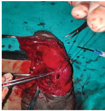
Figure 3. Rent in the tunica albuginea in the ventral shaft